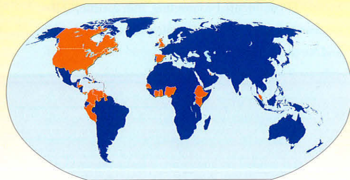
■ Countries currently represented on the Florida Memorial University campus.

The Florida Memorial University community is vibrant and diverse. Our students, faculty, and staff come from more than half the United States and more than 30 countries. This is one of the greatest benefits of a college education—your exposure to a broad range of world views and intellectual diversity.